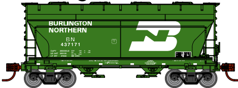
ATH93987 HO RTR ACF 2970 Covered Hopper, BN Green #437171 ATH93988 HO RTR ACF 2970 Covered Hopper, BN Green #437359 ATH93989 HO RTR ACF 2970 Covered Hopper, BN Green (3)