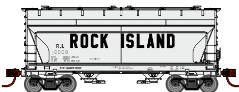
ATH93993 HO RTR ACF 2970 Covered Hopper, RI #12009 ATH93994 HO RTR ACF 2970 Covered Hopper, RI #12369 ATH93995 HO RTR ACF 2970 Covered Hopper, RI (3)