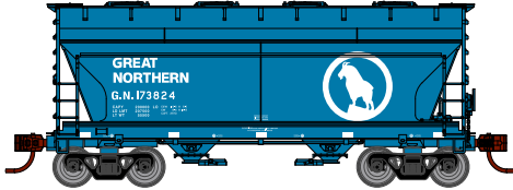
ATH93925 HO RTR ACF 2970 Covered Hopper, GN Big Sky Blue #173824