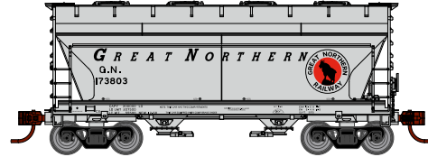
ATH93979 HO RTR ACF 2970 Covered Hopper, GN Grey #173803 ATH93980 HO RTR ACF 2970 Covered Hopper, GN Grey (3)