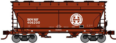
ATH93981 HO RTR ACF 2970 Covered Hopper, BNSF Brown #406200 ATH93982 HO RTR ACF 2970 Covered Hopper, BNSF Brown #406266 ATH93983 HO RTR ACF 2970 Covered Hopper, BNSF Brown (3)