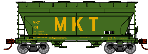
ATH93990 HO RTR ACF 2970 Covered Hopper, MKT Green #451 ATH93991 HO RTR ACF 2970 Covered Hopper, MKT Green #468 ATH93992 HO RTR ACF 2970 Covered Hopper, MKT Green (3)